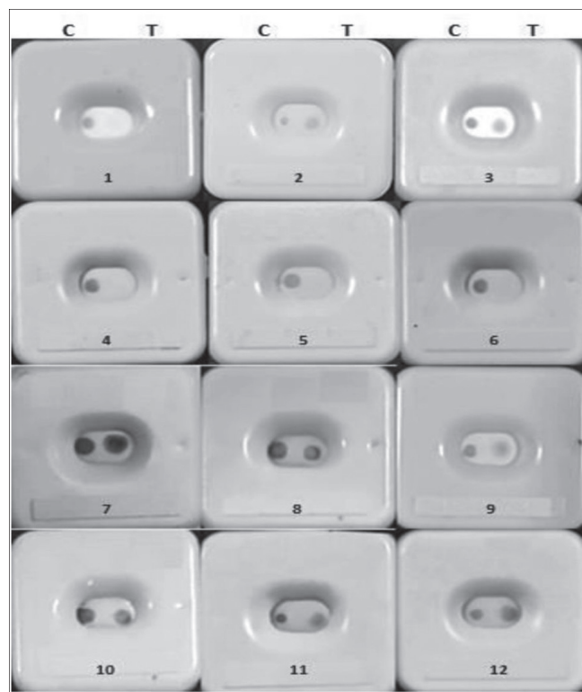
Fig 2. mNERIFA results with representable whey samples. mNERIFA results are visualized representatively. The first line numbered 1,2 and 3 show negative, 2, and 20 CFTU antibody results, respectively. The second line illustrates pooling negative results (no 4, 5 and 6) and 3rd and the bottom line show pooling (7,8,9) and individual positive sera (10,11,12) of different OD values selected respectively