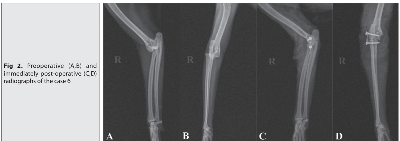
Fig 2. Preoperative (A,B) and immediately post-operative (C,D) radiographs of the case 6

cases (case 1, 2, 3 and 5) were outdoor cats which were kept in the owners' garden.