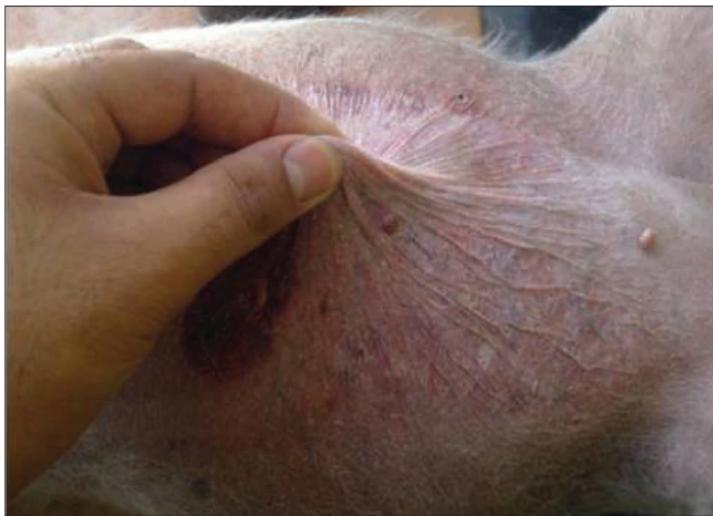
Fig 1. Alopecia, thin skin and vascularization Şekil 1. Alopesi, incelmış deri ve damarlaşma

A 5-year-old, 12 kg female, Terrier breed dog having the complaints of anestrus, polyuria, polydipsia and alopecia referred to Small Animal Veterinary Teaching Hospital. Alopecia, thin skin with hyperpigmentation, calcinosis cutis and vascularization and, pendulous abdomen were remarkable in physical examination (Fig. 1-2). Initial diagnostic tests included complete blood count (CBC), liver function (Alkaline phosphatase, Alanin aminotransferase, Aspartate aminotransferase, Gamma-glutamyl transferase), some electrolyte analysis (Sodium, Potassium, Chloride) and high dose dexamethasone