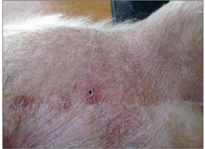
Fig 2. Calcinosis cutis