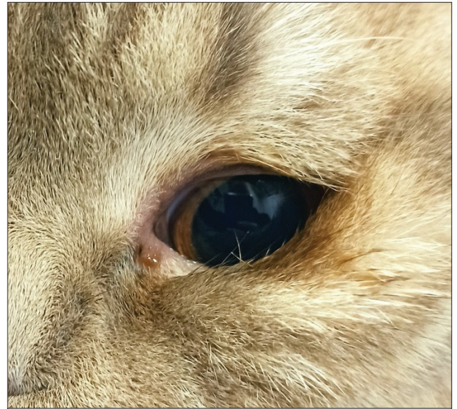
Fig 3. Severe entropion in the lateral lower eyelid with more than 180 degrees of rotation in a 1-year-old male British Shorthair