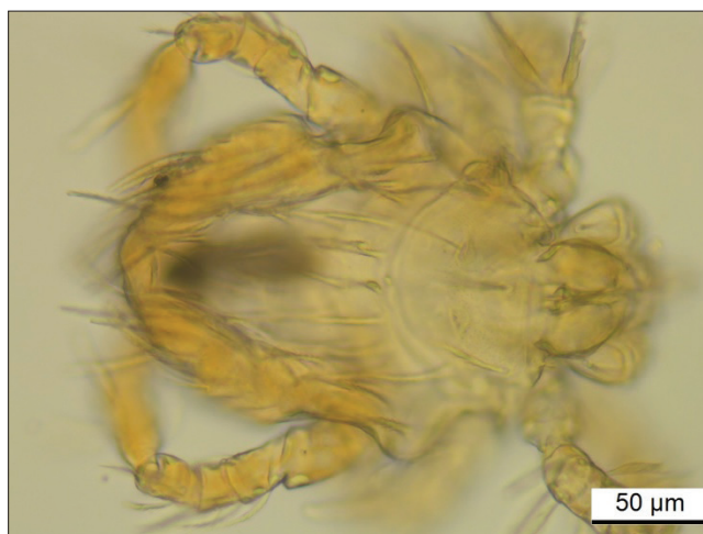
Fig 2. Kepkatrombicula desaleri Methlagl, 1928 - scutum