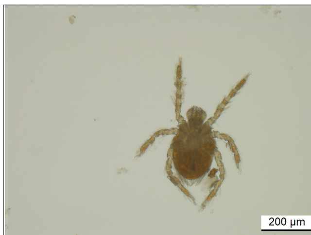
Fig 1. Kepkatrombicula desaleri Methlagl, 1928 - dorsal view

Out of the studied 88 goats in the first flock, 15 were positive for the parasite (17%). In the second studied flock, 7 out of 53 animals (13%) harboured mites from the same species. Neither squamae nor crusts were found out on the skin surrounding the attachment site of the parasites, and goats showed no clinical signs. Infected goats were