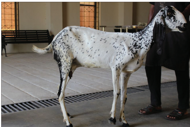
Fig 1. Beetal goat with non-weight bearing grade 4 lameness on the right forelegæ

A 3-year-old, female Beetal goat weighing 29 kg was presented to the Veterinary Teaching Hospital, Cholistan University of Veterinary and Animal Sciences, Bahawalpur with grade 4/5 right leg posture shown in (Fig. 1). Anamnesis revealed that the animal had been lame for