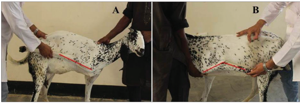
Fig 2. Biceps test was performed on right (A) and left forelegs (B). An imaginary line was drawn from the head of the humerus to radius ulna and from radius ulna to carpal joint. The biceps tendon ruptured foreleg did not show any curve formation at the elbow joint (A) but there was clear curved formation at the elbow joint in healthy biceps tendon foreleg (B)