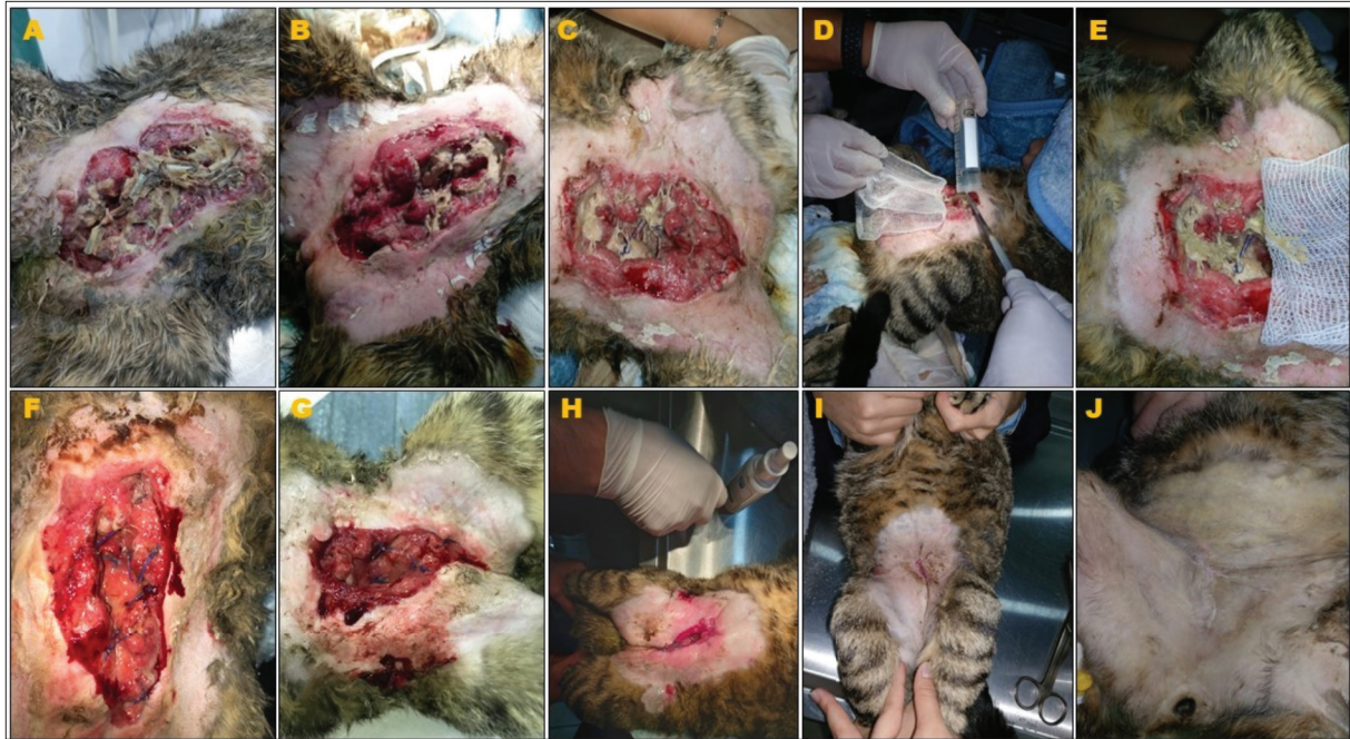
Fig 2. A: The status of the wound before MDT, B and C: The appearance of the wound after the First and second maggot application, D and E: Steps of third maggot application, F: The appearance of the wound after the third maggot application, G: The appearance of the wound after the fourth maggot application, H: The appearance of the wound after the fifth maggot application, I and J: The appearance of the wound area after MDT

on the wound's surface within a bio bag in the indirect contact technique [16]. Mumucuoglu and Taylan Özkan [1] noted that the maggots within the bio bags could not thoroughly debride the necrotic tissues. Therefore, the direct contact technique was preferred considering the size of the wound and the condition of the necrotic tissues in the current case study.