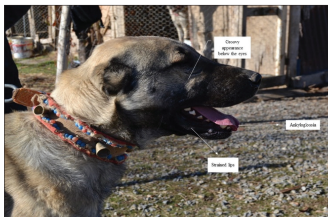
Fig 2. Some stress behaviour parameters in Kangal shepherd dogs with ankyloglossia after exercise

shown in Table 2 . Stress related behavior was observed as increased in both groups at the end of 15-min exercise period. Notably, stress behavioral parameters (strained lips, avoidance, yawning, lowering the body position, tail between hind legs and groovy appearance below the eyes) increased in dogs with ankyloglossia at the end of 15-min exercise ( Fig. 2 ). In addition, it was determined that the number of Kangal shepherd dogs with ankyloglossia exhibiting the behavior in the same stress behavioral parameter is higher than the number of Kangal shepherd dogs without ankyloglossia.