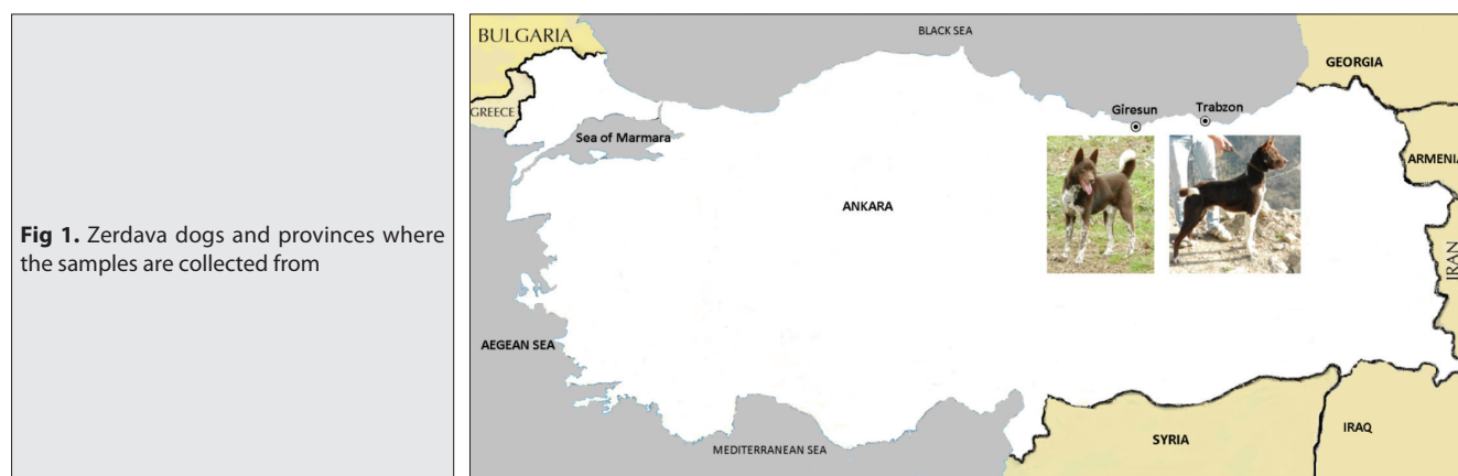
Fig 1. Zerdava dogs and provinces where the samples are collected from

presented in Table 1 . The mean live weight values of Zerdava dogs were 16.02 \pm 0.35 kg. The mean withers height, rump height and body length were found to be 48.20 \pm 0.21 , 47.08 \pm 0.24 and 51.24 \pm 0.23 cm, respectively. The mean head length was recorded as 20.95 \pm 0.09 cm, the face length was 8.49 \pm 0.05 and the ear length was 10.04 \pm 0.07 cm. The withers height, rump height, chest depth, chest circumference, live weight, shank circumference, distance between the ears, ear length and mouth circumference were statistically significant depending on age. Moreover, the withers height, rump height, body length, chest depth, chest circumference, shank circumference, head length, face length, ear length, tail length and mouth