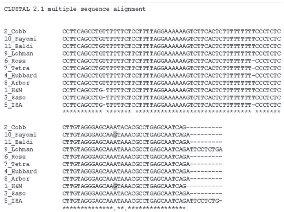
Fig 2. Sequence alignment of Mx gene from different chicken present in Egypt

is 50% and AG genotype is 50% (Table 3).