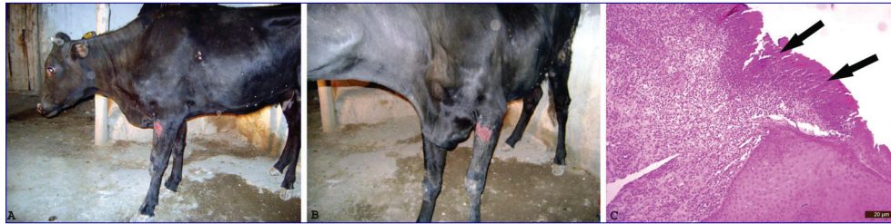
Fig 1. Severe pruritus in the front left leg and automutilation in animal (A, B), necrotic foci in skin (C), H&E, Bar: 20 µm

As Aujeszky's disease can be confused with toxication and several disorders progressing with neurologic symptoms, making certain diagnosis is extremely important [14]. In order to make certain diagnosis medical history, clinical findings, hematological and biochemical parameters are not sufficient, therefore laboratory diagnosis, various direct and indirect tests should be also performed. The most