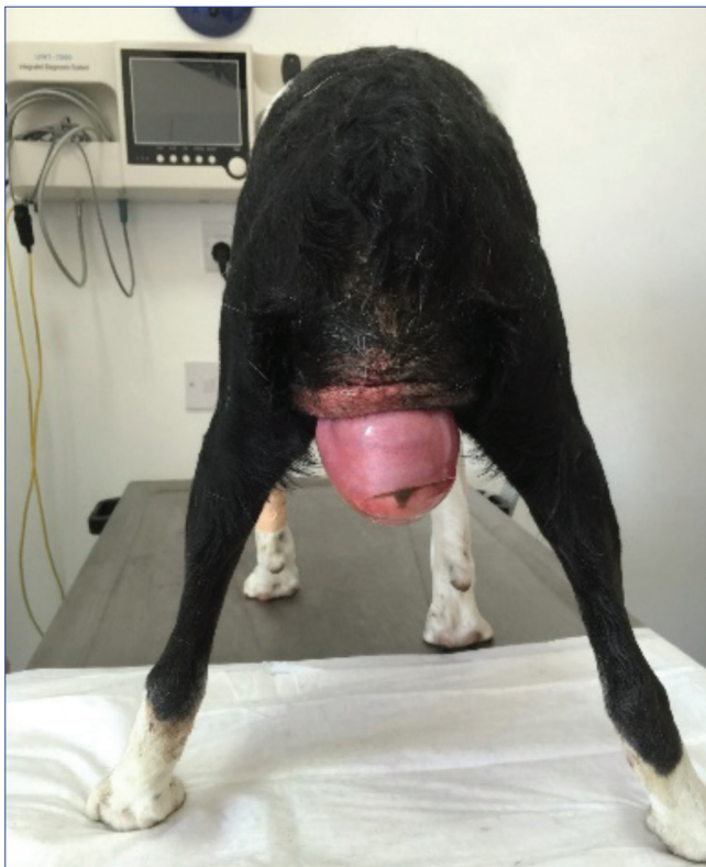
Fig 1. Appearance of vaginal prolapse

One day previously a mass was detected and prolapsed mass is rejected and vulva suture was applied in any clinic. The vagina is protruded completely due to tenesmus and also green flux from orificium uteri externa were observed (Fig. 1). Prolapsed vagina was approximately 17 cm in length and 9 cm wide. When the prolapsed mass were examined by external cranial palpation; various body parts of puppies determined to be inside this mass and also urinary bladder was observed to be protruded. Ultrasonography (USG) were performed directly on the tissue (Mindray®DC-N3Vet; 5.0 MHz; convex probe); puppies were revealed to be attached to the first third of the prolapsed vagina and showing no signs of vitality (no heartbeat or movement detected). The vagina was also shown to be interlocked with the cranial part of the uterus, with its borders clearly defined (Fig. 2). Ultrasonography