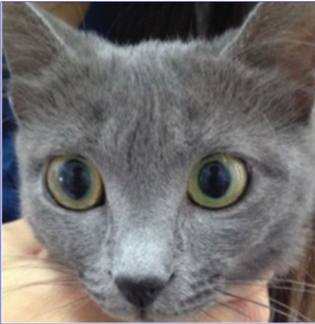
Fig 3. Recovery of the Horner's syndrome within one month post-operatively

operative treatment, it is recommended to perform traction and avulsion of the polyp through the ear canal or in a nasopharyngeal way. It was reported that corticosteroid (1 to 2 mg/kg/day for 14 days) in the postoperative period reduces relapse in cats by 11% [2,5]. VBO was recommended for operative treatment of polyps that originate from the middle ear [3]. Positive outcomes were obtained from the corticosteroid application following the traction-avulsion method, and no mid-term relapse was encountered.