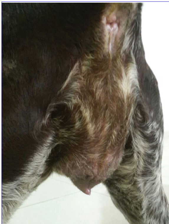
Fig 2. Ten days after the second surgery, full recovery was observed