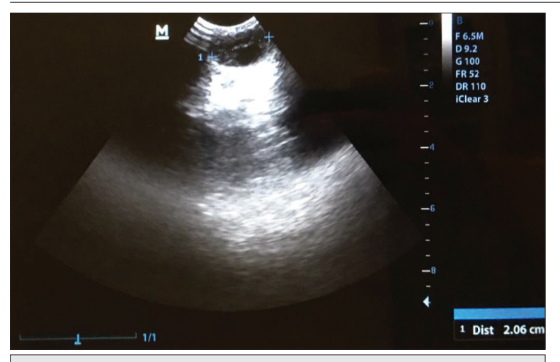
Fig 3. Ultrasound image of a dog before neoadjuvant chemotherapy that produced a partial response