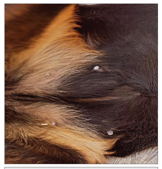
\ensuremath{\mbox{Fig}}\xspace 2. Clinical appearance of partial response in the tumor size after treatment

Treatment options for CMTs are limited compared with human breast cancers. However, treatment protocols for human breast tumors can be considered as treatment options for CMTs <sup>[1]</sup>.