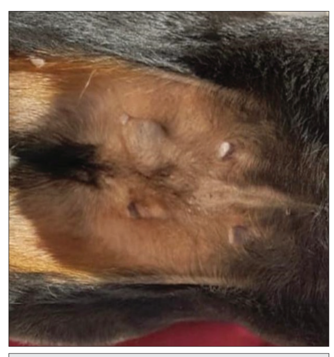
Fig 1. Clinical appearance of mammary tumor on right inguinal mammary gland before treatment