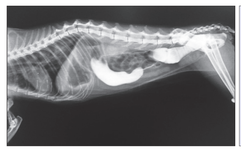
Fig 1. Radiographic appearance of the cat 72 h after contrast agent administration. The obstruction could be seen in the colon descendens

the patient was examined by further radiological tests with contrast material to differentiate obstructive or nonobstructive distention. As a result, local obstruction of the colon descendens was observed on radiographs 72 h after iohexol contrast media (Omnipaque; GE Healthcare) administration (700 mg iodine/kg with an iodine concentration of 300 mg iodine/mL diluted with tap water until a total volume of 10 mL/kg, via an orogastric tube) (Fig. 1). The patient then was referred to median laparotomy to determine the reason of the obstruction. Surgical laparotomy was performed under general anesthesia and a mass 1 cm in diameter was found on the abdominal wall showing adhesion with increased adipose tissue to mesenteric margin of the colon descendens. The mass and the increased adhesive adipose tissue were completely removed, and the omentalization of the area was carried out. The mass was submitted to Pathology Department of IUC Veterinary Faculty for histopathological examination. Postoperative treatment was provided with intestinal diet (digestive care i/d, Hills) and with metoclopramide (Metpamid; Sifar) 1.0 - 2.0 mg/kg/d IV as a constant rate infusion with isotonic serum for 72 h as a parenteral fluid replacement to treat the severe dehydration and general condition of the animal. Then the additional application for metoclopramide (Metpamid; Sifar) was initially provided with 0.2 mg/kg, SC, q8h for 4 days and then given orally