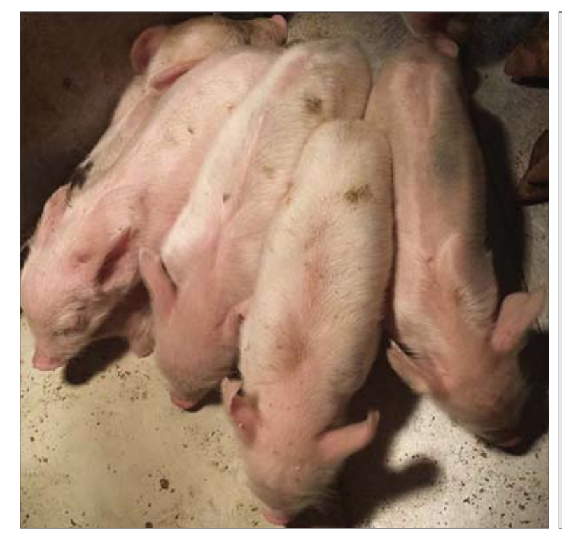
Fig 1. The clinical picture of piglets aged 20 \pm 3 days, after AF intoxication

Macroscopical examination revealed bright, yellowish color of the liver with subserous petechial bleedings and enlarged gallbladder ( Fig. 2 ). The tissues were fixed in 10% formalin and processed by routine paraffin technique. Microtome sections of 5 \mu m thickness, after deparaffinization, were stained using standard hematoxylin and eosin method. Vacuolization of hepatocytes, necrosis and fatty degeneration of the liver were determined histopathologically ( Fig. 3 ).