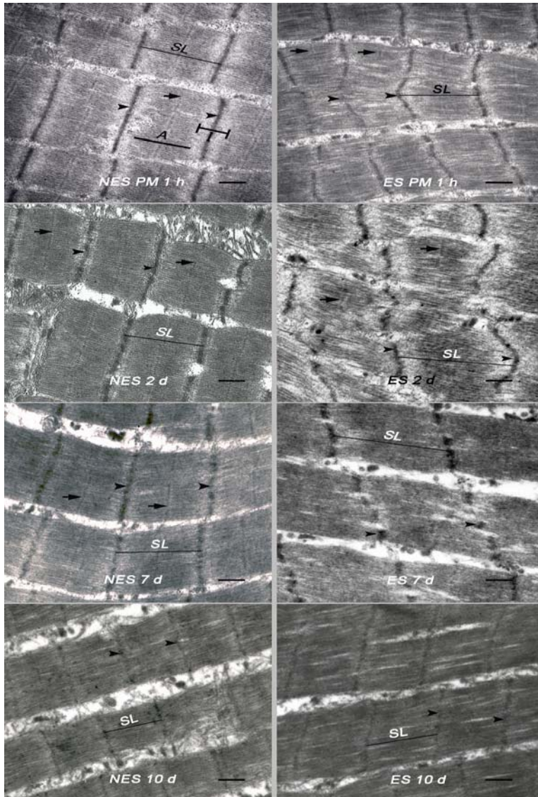
Fig 1. Electron microscopic appearance of LDT myofibrils. A: A band, SL: sarcomer length, Z band: arrowheads, M-line: arrows. Bar: 0.3 \mu m

Şekil 1. LDT miyofibrillerinin elektron mikroskopik görünümü. A: A bandı, SL: sarkomer uzunluğu, Z: okbaşları, M-çizgisi: oklar. Bar: 0.3 \mu m