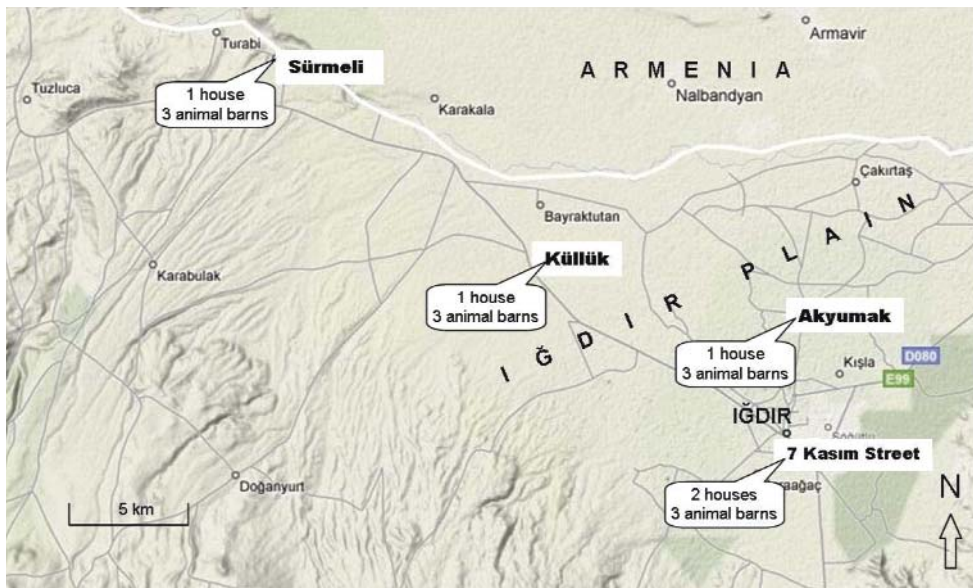
Fig 1. Location of indoor habitats where mosquito sampled in Aras Valley

Şekil 1. Aras Vadisi'nde sivri-sineklerin örneklendiği kapalı habitatların lokasyonu