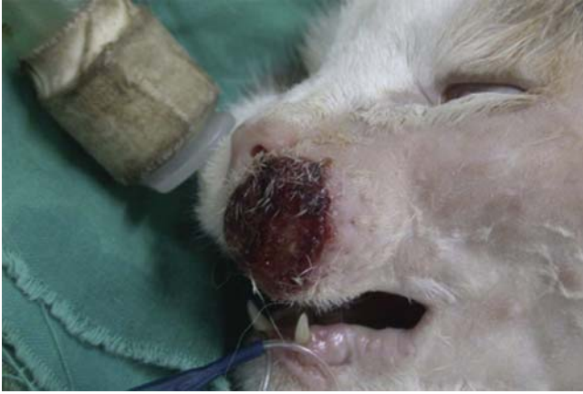
Fig 1. Appearance of tumour before surgery

Şekil 1. Tümörün cerrahi öncesi görünümü