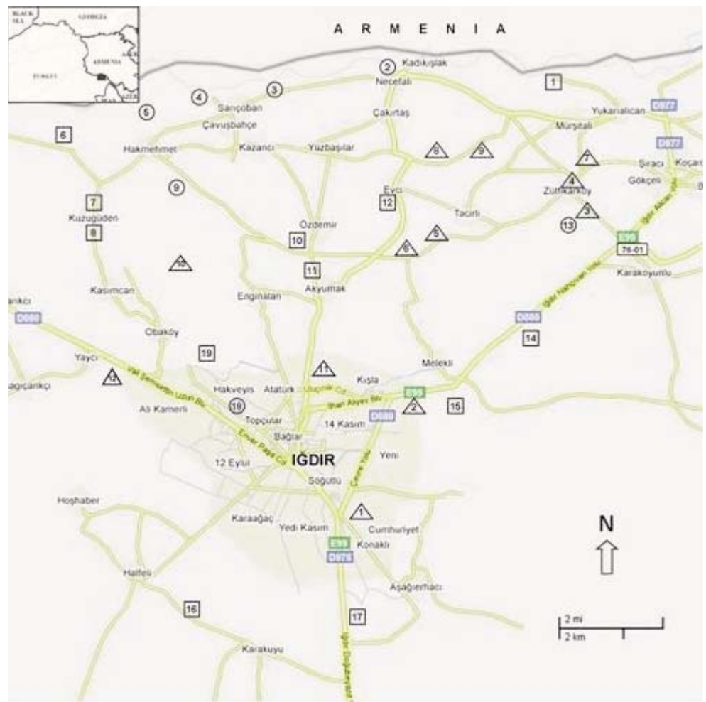
Fig 1. The study area and location of mosquito breeding sites [permanent breeding sites (□: drainage canals, O: pools), and temporary breeding sites (Δ)]

Şekil 1. Çalışma alanı ve sivrisinek üreme alanlarının yeri [kalıcı üreme alanları (□: drenaj kanalları, O: su birikintileri) ve geçici üreme alanları (Δ)]