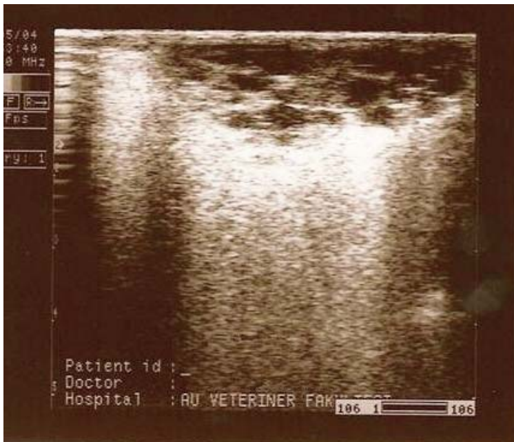
Fig 1. An USG image of a mammary malign mix tumor in an 11-years-old Terrier. Note the irregular shape, lobulations, acoustic transmission and invasiveness into the surrounding tissue

Şekil 1. 11 yaşlı Terrier ırkı bir köpeğin meme dokusundaki bulunan malign miks tümörün ultrasonografik görüntüsü. Tümör düzensiz şekil, lobulasyon, akustik iletim ve çevre dokulara doğru yayılan uzantılara sahip kenar özelliği göstermektedir