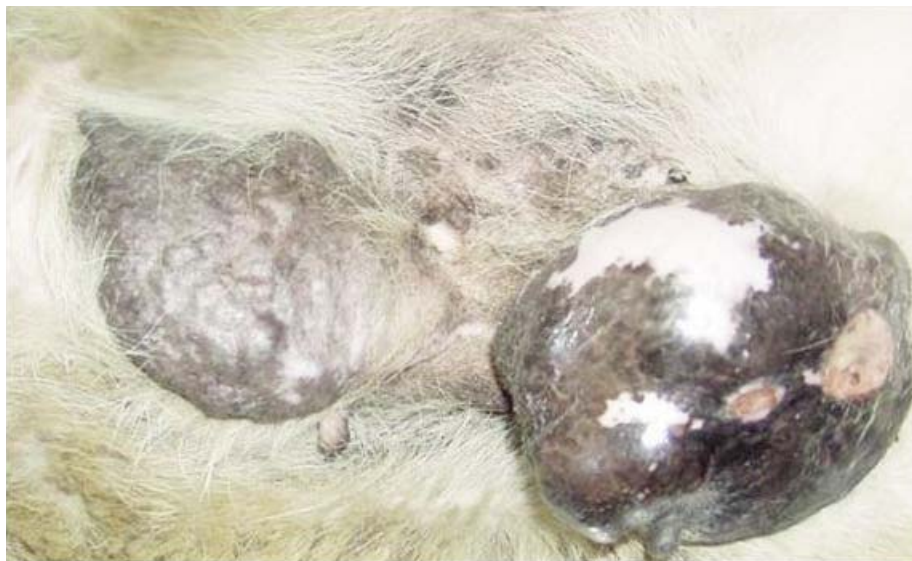
Fig 4. A macroscopic image of a complex carcinoma in a 10-years-old cross breed dog

Şekil 4. 10 yaşlı kırma ırklı bir köpeğin meme dokusunda bulunan kompleks karsinoma tanılı tümörün makroskopik görünümü