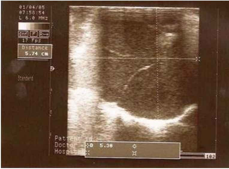
Fig 2. A gray-scale image of malign mix tumor in a 7-years-old Terrier. Note the heterogeneous echotexture, varied internal echogenicity

Şekil 2. 7 yaşlı Terrier ırkı köpeğin meme dokusundaki bulunan malign miks tümörün ultrasonografik görüntüsü. Tümör heterojen ekotekstür ve karma iç ekojenite özelliklerini göstermektedir