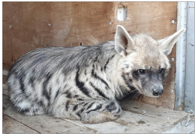
Fig 2. Blind striped hyena, with states of depression and no response to stimuli

of depression were detectable. In addition to this, the most obvious clinical sign was blindness. Inability to pass Maze test and see objects, absence of PLR Reflex, Menace Response and Dazzle Reflex was detected during behavioral observation and clinical examination. Ataxia as swaying, Anorexia, lethargy and tenesmus was another clinical signs of this Striped hyena. The Striped hyena did not respond to stimuli, had states of depression and was blindness (Fig. 2). Due to clinical signs and suspected rabies, the animal was euthanized with a high dose of sodium thiopental after five days.