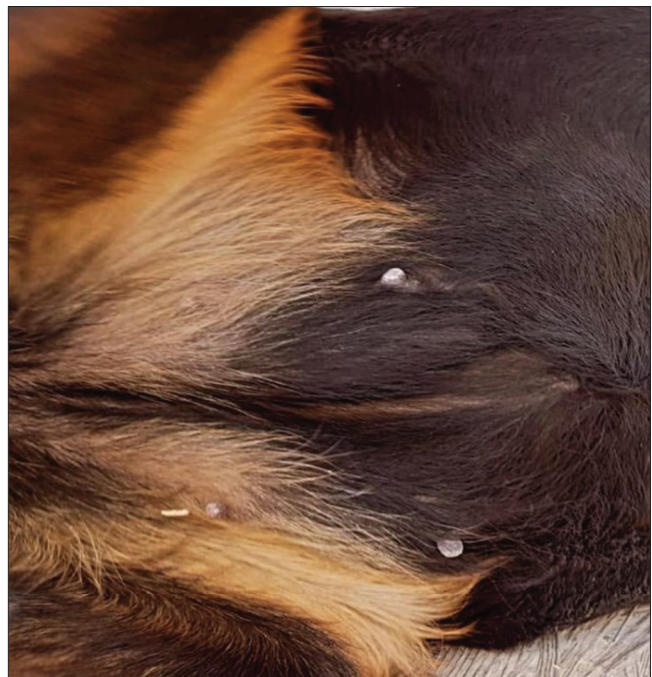
Fig 2. Clinical appearance of partial response in the tumor size after treatment