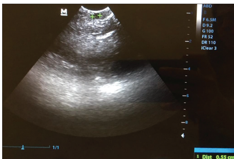
Fig 4. Ultrasound image of a dog after 4 weeks of neoadjuvant chemotherapy that produced a partial response