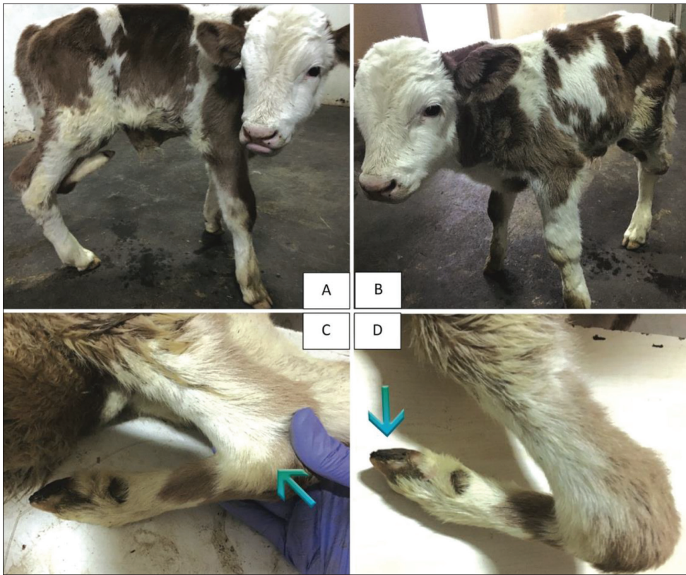
Fig 1. A, B: View of the patient from right and left side with the animal standing; The animal can easily stand and walk on three limbs; C: Excessive flexural deformity and appearance of torsioned joint ( arrow ). The front face of the limb is at the back and the front of the back is at the distal part of the distal part of the tarsal joint (there is approximately 180° rotation); D: In the rotated limb, the solea part of the 3 rd phalanx was located dorsally ( arrow )