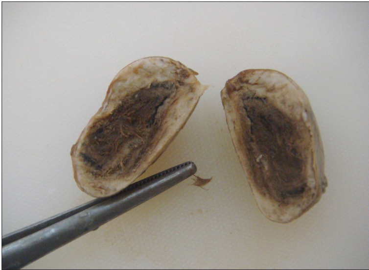
Fig 1. Cut surface of the mass contained abundant hair

In veterinary medicine, dermoid cyst is most frequently seen in dog breeds including Rhodesian Ridgeback, Siberian Husky, Shih Tzu, Boxer, and Kerry Blue [2,4,8]. Rhodesian Ridgeback has been reported to have a genetic tendency to dermoid cyst formation [1,2,4,10]. Dermoid cyst is a rare formation in cats and according to the authors' knowledge there are only a few reports about dermoid cysts and dermoid sinuses. In these reports, dermoid cysts and sinuses were seen in various locations such as dorsal