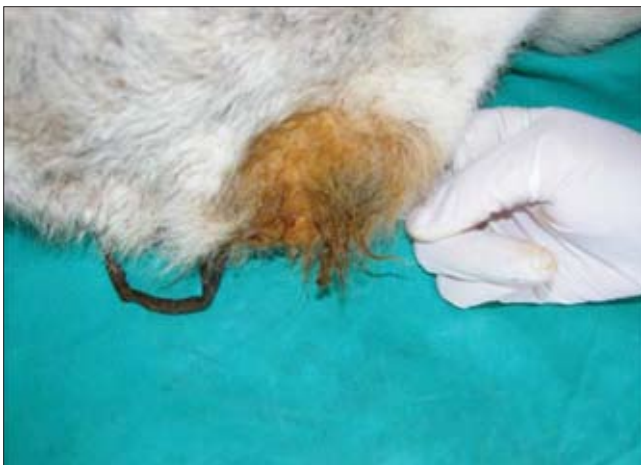
Fig 1. In case one, the meconium was seen in and around the prepuce Şekil 1. Birinci olguda prepüsyumun içinde ve etrafında mekonyum görülmekte

In clinical evaluation of one-day-old male Simental breed calf, lack of anal opening and meconium coming from the prepuce and tenesmus were observed. In radiography of the abdomen megacolon and enlargement of secum with gas were detected. Complete blood cell count and blood serum biochemical analysis were normal. Same anesthesia procedure of calf one was used in calf two.