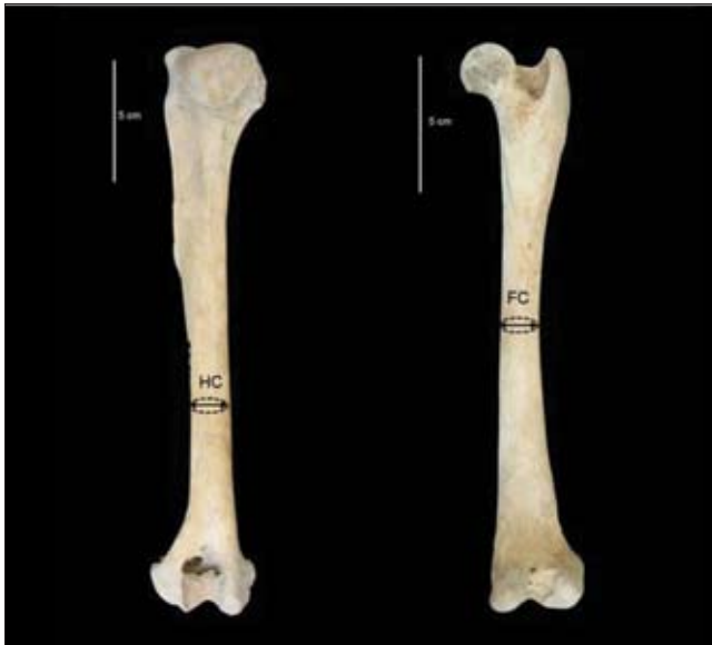
Fig 2. Long-bone measurements. Left: humerus (posterior view); right: femur (posterior view); HC - humeral circumference; FC - femoral circumference

The body weight obtained were then compared with values from contemporary canine breed [25,26], and other mediaval [27] and Iron-Age archaeological sites [17]. This was how we obtained data that would give an idea of the size and morphologies of the Yenikapı Byzantine dogs.