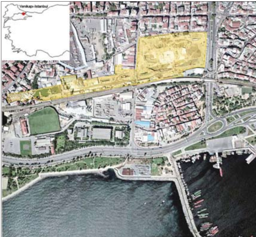
Fig 1. Yenikapı excavation area [23]

As the first step in estimating body weights, osteometric measurements (humeral and femoral midshaft circumference measurements) of the long bones were taken and the calculation was carried out with the aid of formulations proposed by other authors for estimation of the body weight of carnivores [6,10,17] . As it is considered a reliable method, the "Anyonge equations" were used in estimating body weights in this study [6] , as quoted by Onar [17] .