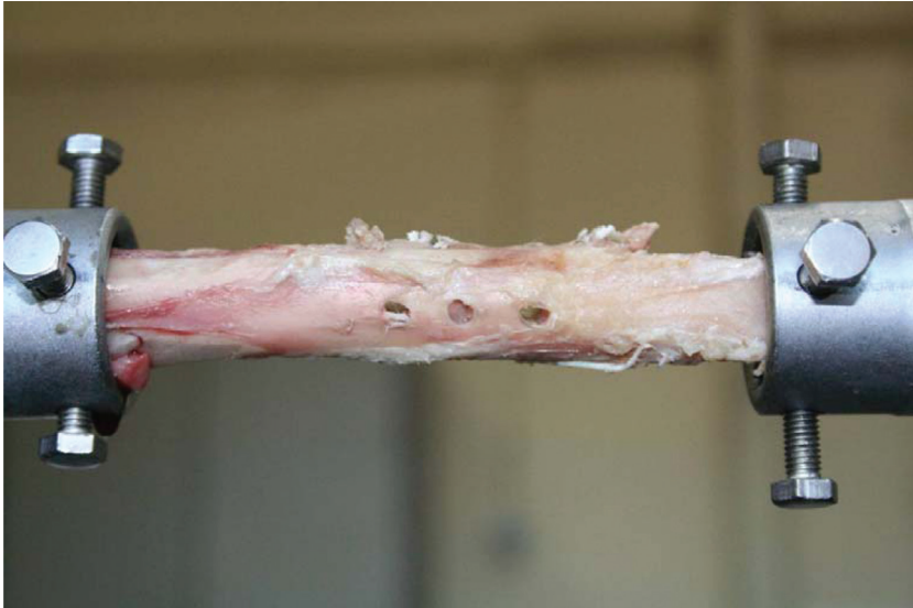
Fig 1A. The equipment used to fix the femur bones before the torsion test

sheep femurs cut into equally sized pieces (75 mm), ensuring that the internal and external diameters of the bones were similar. The bones were divided into 8 groups, each of which was further subdivided into 4 groups (1-4 holes in the range of 2.0 to 5.5 mm. with a 0.5 mm difference between each group) were drilled in the bones. The holes were drilled in the middle of the bones at 0.5 cm intervals. The ends of the bones were fixed into a device when they were subjected to rotation tests. Torsion tests were carried out on a Tec equipment SMS21 model torsion testing machine, and the bones were securely gripped in a special grip arrangement (Fig. 1A, 1B). The tests were carried out at a torsional speed of 30°/min. The torque and the corresponding torsion were continuously measured during the tests by appropriate devices attached to torsion testing machine, and the obtained values were transferred to a computer; software was used to evaluate the results. The test endpoint was partial or complete fracture of the bone identified by a drop in torque. During the application of simultaneous torsional forces, which were increased evenly in each test group, the magnitudes of the forces leading to fracture and their angles were recorded. Statistical analysis was carried out using NCSS 2007 software (NCSS).