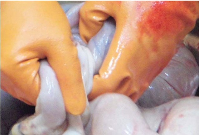
Fig 2. The anatomical macroscopic view of the jejunum-jejunal intussusceptions

Şekil 2. Jejunum-jejunal invaginasyonun anatomik makroskopik görünümü