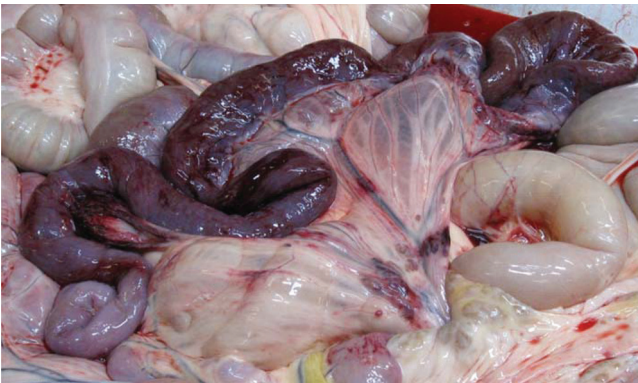
Fig 3. The invaginated part of the bowel

Şekil 2. Jejunum-jejunal invaginasyonun anatomik makroskopik görünümü