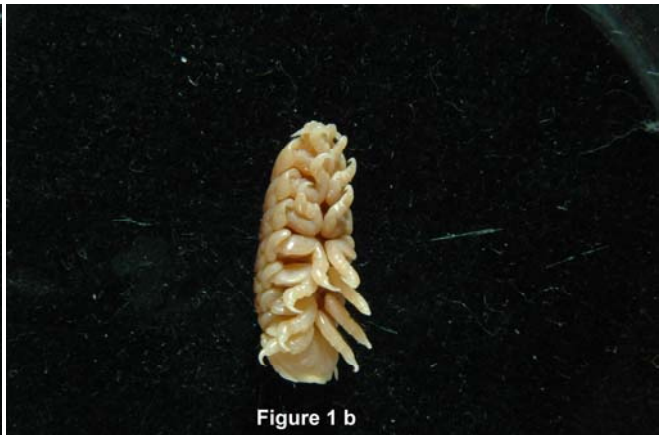
Fig 1. a and b: Dorsal and ventral view of C. capri

Şekil 1. a ve b: C. capri 'nin dorsal ve ventral görünümü