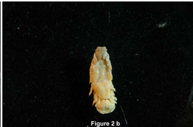
Fig 2. a and b: Dorsal and ventral view of C. parallela

Şekil 2. a ve b: C. parallela 'nin dorsal ve ventral görünümü