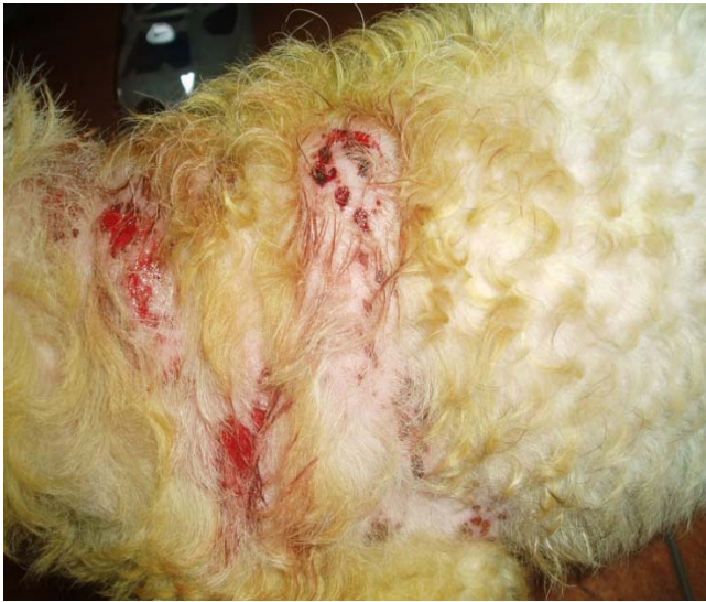
Fig 2. Severe pruritic area

Şekil 1. Terier köpekte trunkal bölgedeki pyotavmatik dermatitis