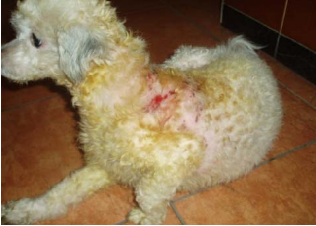
Fig 1. Pyotraumatic dermatitis on the truncal region terrier dog

should be taken into account with accompanying CDV infection, in cases with unresponsive medical treatments involving antibiotics and antiseptics.