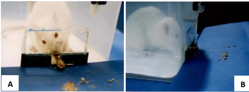
Fig 1. Rat observed during the use of the right paw reaching test food in quadrupedal position (A) and side view (B)

Şekil 1. Dört ayak pozisyonundaki sıçanın besine uzanma testi esnasında sağ pençesini kullanımı (A) ve yandan görünüşü (B) görülmektedir