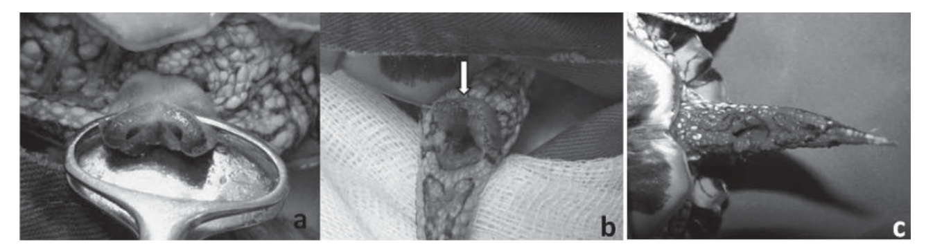
Fig 2. The appearance of phallus after all of the necrotic tissues were removed (a), The intact phallus tissue was sutured (white arrow) (b), The base of the phallus was replaced into the cranial base of the tail (c)