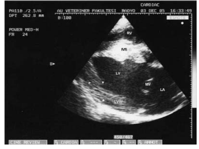
Fig 4. An echocardiogram obtained from the left parasternal long axis of a 21-year-old English horse with regional hypokinesia and spontaneous contrast. The area that did not display enough synchronisation in the left ventricle wall (LVW) during systole is shown with arrow heads

Regional hypokinesia was seen on LVFW in 10 cases ( Figure 4 ). Spontaneous contrast was detected on 6 of these cases. In one case with mitral valve degeneration and pericardial effusion, spontaneous contrast was accompanying to these findings. In the other 4 cases with bradycardia and Spontaneous contrast, no evidence of cardiac disease was detected on the echocardiographic evaluations. Only pericardial effusion was seen in 7 cases.