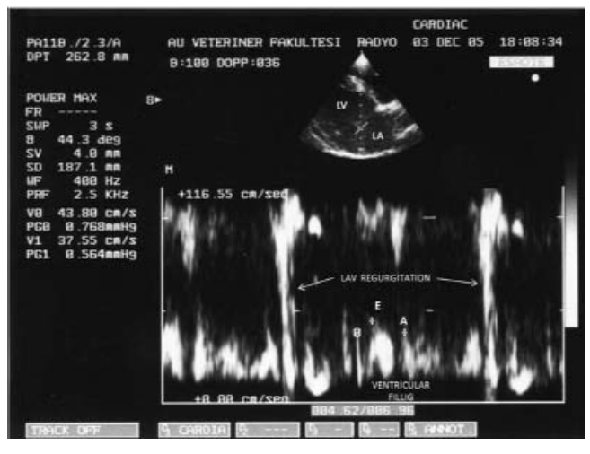
Fig 1. A PW Doppler echocardiogram obtained from the right parasternal long axis of an 11-year-old Holland horse with mitral insufficiency. The bands vertical to the baseline due to the aliasing caused by the regurgitant jet are observed as a turbulent flow

In 5 cases, LAID was detected between values of 139-144 mm. Dilatation in LA was detected. In 3 of these cases mitral, and in 2 of them tricuspidal insufficiency were detected. In the cases with mitral insufficiency, one case was seen with valvular degeneration. On the horses without any clinical findings, the small jet flows seen on the AV valves were evaluated as physiologic and were not accepted as findings of insufficiency. Exercise intolerance was seen on the cases with AV valves insufficiency and noisy heart sounds were detected on auscultation after exercise. In the 13 cases with AV valves insufficiency, small jet flow was detected in 3 of them, mild jet flow