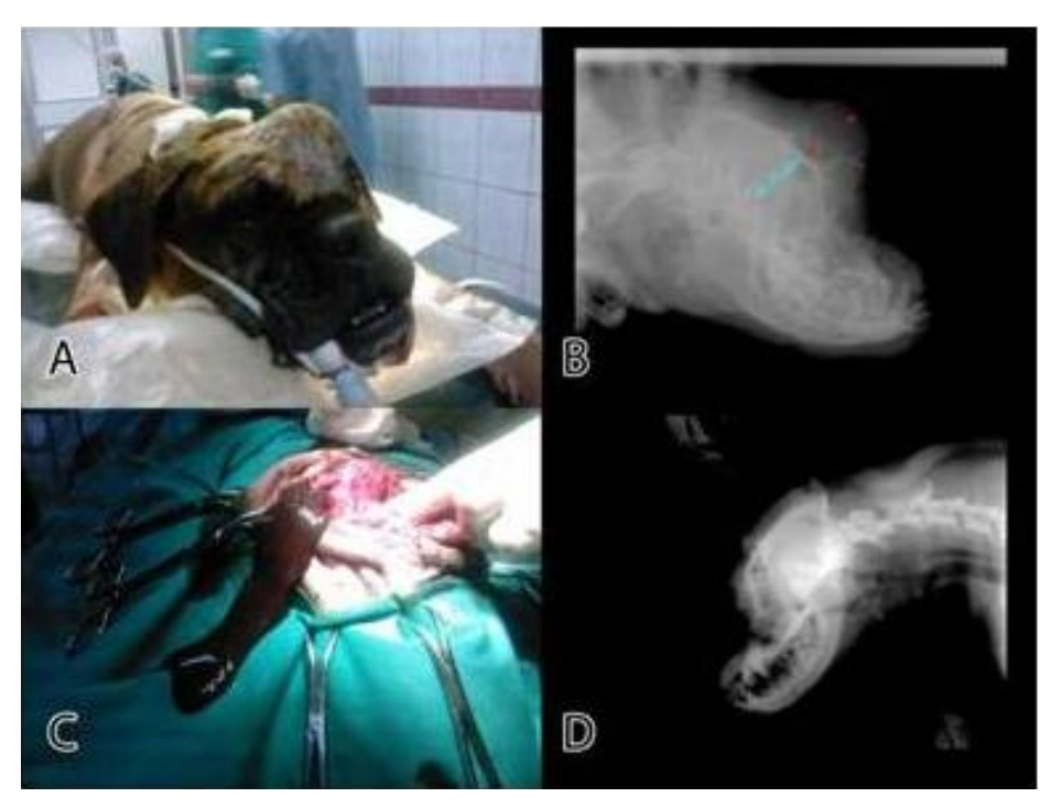
Şekil 1. A - Kitlenin preoperatif görünümü B - Radyografik görünümü. C - İntraoperatif olarak koyu kıvamlı müköz karakterli içerik. D - Postoperatif radyografik görünüm