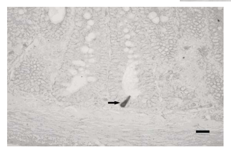
Fig 3: Somatostatin-immunoreactive cell in the duodenum mucosa. ABC. Bar: 50 \mu m

Şekil 3: Duodenum mukozasında somatostatin-immunoreaktif hücreler. ABC. Bar: 50 µm