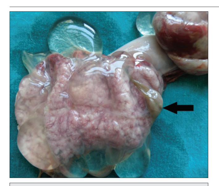
Fig 2. Partial hydatidiform mole-placental changes and embryo (arrow)

In addition, trophoblastic inclusions are rarely observed in complete moles, while atypia of trophoblasts are often present [4]. In the current case trophoblastic inclusions were observed frequently and atypia of trophoblasts were less pronounced. Collectively, most of the histopathological features of partial mole in the human were observed in the current case.