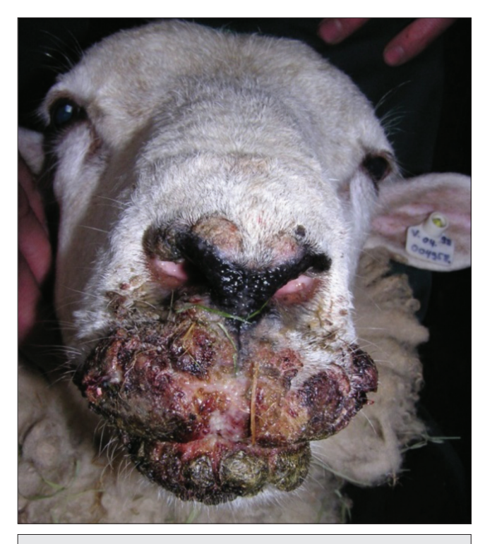
Fig 1. Clinically view of the ecthyma contagiosa in a Akkaraman sheep

PON1 activity, TSA, HDL, MDA, NO and GSH levels were measured in the blood samples taken from the animals and PCR evaluation was performed to confirm the diagnosis. In biochemical evaluations; plasma PON1 activity, HDL, and GSH levels obtained from the animals in the contagiosum disease group were statistically significantly low (P<0.001)