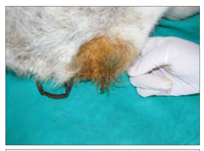
Fig 1. In case one, the meconium was seen in and around the prepuce Şekil 1. Birinci olguda prepüsyumun içinde ve etrafında mekonyum görülmekte

In clinical evaluation of one-day-old male Simental breed calf, lack of anal opening and meconium coming from the prepuce and tenesmus were observed. In radiography of the abdomen megacolon and enlargement of secum with gas were detected. Complete blood cell count and blood serum biochemical analysis were normal. Same anesthesia procedure of calf one was used in calf two.