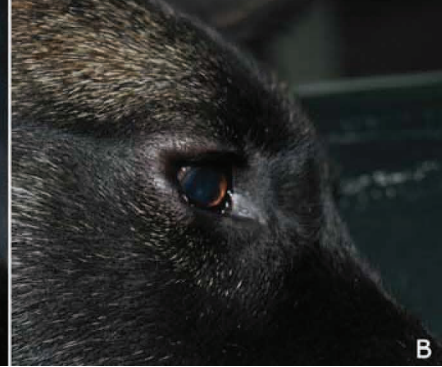
Fig 1. Preoperative (A) and postoperative (B) appearance of the right eye of case.