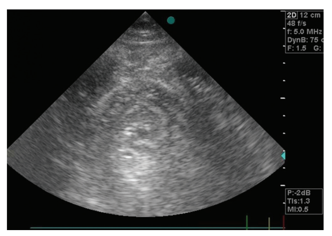
Fig 1. Ultrasonographic appearance of the jejuno-jejunal intussusception (Bull's eye)