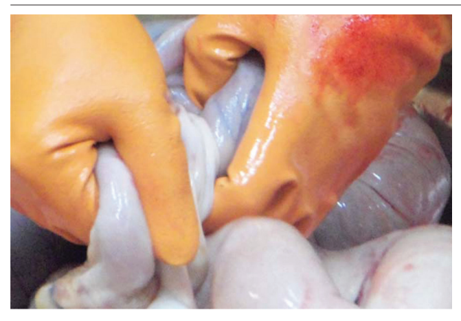
Fig 2. The anatomical macroscopic view of the jejuno-jejunal intussusceptions

Şekil 2. Jejuno-jejunal invaginasyonun anatomik makroskobik görünümü