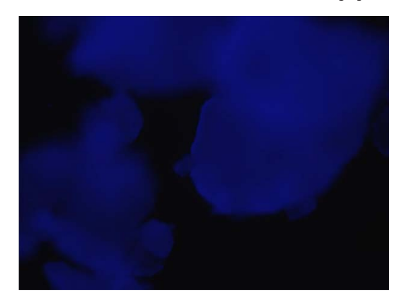
Fig 1. Fluorescent labeled feed Şekil 1. Floresans işaretli diyet

In this study four groups of one-day old broiler chicks were arranged. Each group (n=4) was assigned to a different fluorescent labeled diet. The first group is the control group fed with the basal diet without any fluorescent tagged molecules as shown in the Table 1 . The second group is the experimental group fed with MOS labeled with a fluorescent tag as shown in the Fig. 1 . The third group is the albumin fed group as the negative control which is known not to be quickly digested and not translocated. The fourth group is the dextran as the positive control which is known to be phagocytosed by dendritic cells. The ratio of fluorescent labeled MOS, albumin and dextran to the basic diet was 20 mg/kg. The