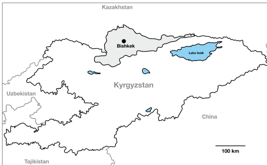
Fig 1. Map of Kyrgyzstan and location of Bishkek

For genomic DNA isolation, 200 µL blood was processed with a commercial kit [PureLink Genomic DNA mini kit (Invitrogen, Carlsbad, USA)]. Target DNA's were kept at -20°C until analysis. To determine each species, a single PCR analysis were made in a final reaction volume of 25 µL containing PCR buffer [750 mM Tris-HCl (pH 8.8), 200 mM (NH 4 ) 2 SO 4 , 0.1% Tween 20], 5 mM MgCl 2 , 125 µM deoxy-nucleotide triphosphates, 1.25 U Taq DNA polymerase (Promega, Madison, WI, USA), primers (20 pmol/µL) and template DNA. Sequence, specificity, target gene and product sizes for primers were demonstrated in Table 1. PCR was performed with an initial denaturation step of 94°C for 5 min was followed by 32 cycles of 94°C for 1 min, 60°C for 1 min, and 72°C for 1 min. A final extension step at 72°C for 5 min was also applied [9]. Positive control DNA for Mhc (GenBank accession no: MG594502) and CMhp (GenBank accession no: MG594500) species and negative controls (nuclease-free water) were also used in the PCR