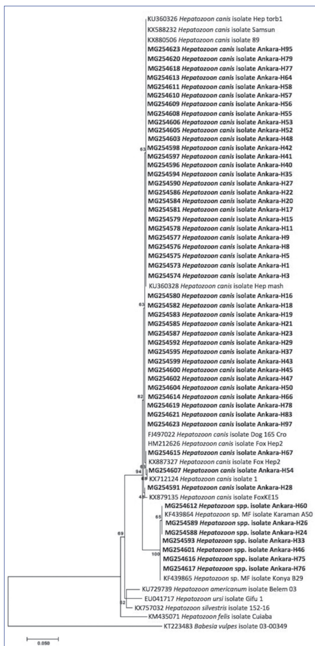
Fig 2. Phylogenetic tree based on aligned sequences of 18S rRNA of Hepatozoon spp. with Babesia vulpes as outgroup and constructed by using Maximum Likelihood method calculated under the GTR+I+G substitution model. The Hepatozoon sequences obtained in this study are shown in bold. GenBank accession numbers of sequences and names of lineages are given before species names

dogs, foxes and a jackal. In addition, Hepatozoon sp. MF isolates were identical to isolates obtained from dogs in the Central Anatolia region.