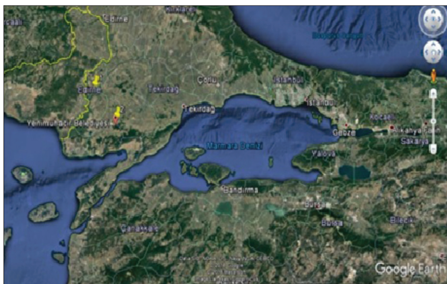
Fig 1. The geographic location of the study region

The experiments were established on May 2, 2016. Two groups were formed as package bee and artificial swarm in the experiments. The experiments were carried out according to the Completely Randomized Design, which will cover 12 beehives in each group (Table 1). Considering the main nectar flows in the region, package bees and artificial swarms were sent eight weeks before the beginning of the main nectar flow. After the package bees were