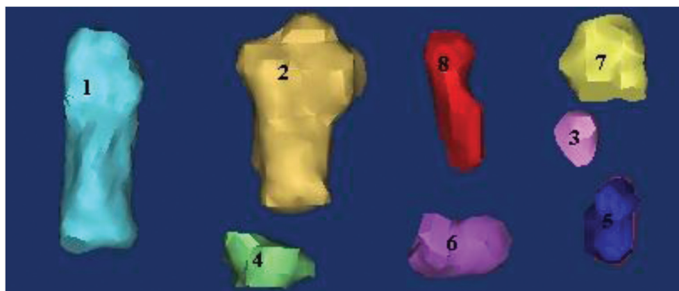
Fig 3. 3D model of tarsal bones

The limitation of this study is the number of the animal. In