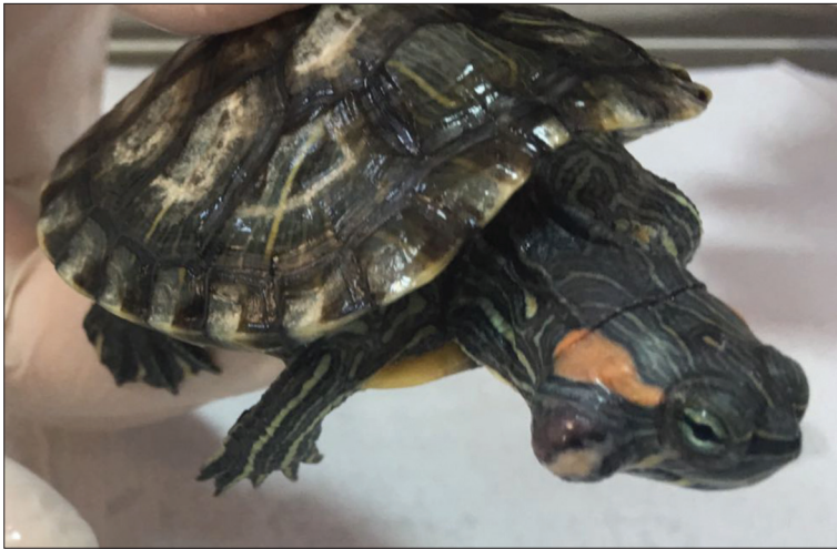
Fig 1. Clinical outlook of unilateral ear abscess

kg of Ketamine HCl (Alfamine, Egevet, Turkey) to the patient. A 3-4 mm linear skin incision covering the upper part of the swelling in the ear area was made, carried up to the abscess pouch, which was then opened. Its content was caseified and removed under sterile conditions. For microbiological examination, samples were taken from both abscess content and by applying a sterile swab to the inner part of the abscess pouch. Next, the abscess pouch was washed with isotonic saline solution.