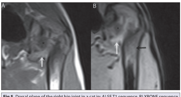
Fig 5. Dorsal plane of the right hip joint in a cat in: A) SET1 sequence, B) XBONE sequence - water-only image. A hyperintense signal in the site of the hematoma is marked with a white arrow . A hyperintense signal indicative of bone marrow edema in a fat-suppressed sequence is marked with a black arrow . A hypointense signal indicating the loss of cartilaginous tissue and proliferation of fibrous tissue in the femoral head is marked with an asterisk

approximately one h after hematoma formation, and it produces a hypointense signal in T2-weighted images. After 24 h, intracellular methemoglobin appears as a hyperintense mass in T1-weighted images. Erythrocytes are decomposed one week after hematoma formation, and they release methemoglobin which increases signal intensity inT1-andT2-weighted images. In the last stage, hemosider inladen macrophages accumulate at the periphery of the hematoma and decrease signal intensity in all sequences <sup>[14]</sup>. A varied signal with hyperintense foci generated by methemoglobin in SET1 and FSET2 sequences is indicative of hematoma organization, and it suggests that the hematoma was formed more than 24 h ago. On the radiograph of the right limb the femoral head was clearly separated from the neck and MRI was performed for confirming the diagnosis. The hematoma formation and bone marrow edema were not visible on the X-ray.