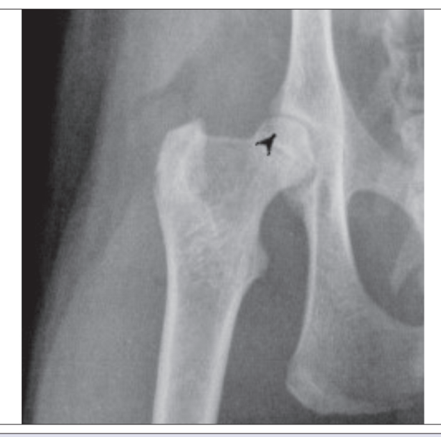
Fig 2. Dorsoventral X-ray of right hip joint in cat. The femoral head contains radiolucent foci ( arrow head )

MRI exam, a decision was made to perform resection arthroplasty of the right femoral head. General anesthesia was maintained by inhalation of 1-2% isoflurane (Aerane, Baxter Polska, Warszawa, 100%) with fentanyl (Fentanyl WZF, Polfa, Warszawa, 50 \mu g/mL) administered by constant rate infusion (CRI) at 10 \mu g/kg/h with an infusion pump. Vital signs were monitored throughout the procedure. Arthroplasty of the right hip joint was performed in the lateral approach. The articular capsule was opened, the separated epiphysis was removed and the femoral neck was resected with a bone saw. Cephalosporin (Cefalexim,