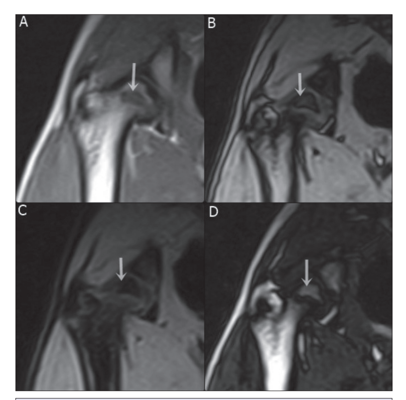
Fig 4. Dorsal plane of the left hip joint in a cat in: A) SE sequence, B) GE sequence, C) XBONE sequence - fat-only image, D) XBONE sequence - water-only image. Arrows indicate hypointense foci in SE and GE sequences and the fat-only image, and hyperintense foci in a fat-suppressed sequence in the femoral head which are indicative of a subchondral cyst

ScanVet Poland, Warszawa, 180 mg/1 mL) at 10 mg/kg IV and meloxicam (Metacam, Boehringer Ingelheim Vetmedica, 20 mg/mL) at 0.2 mg/kg SC were administered preoperatively, and injections were continued for 4 days. The resected femoral head was placed in 10% formalin solution and subjected to a histopathological analysis. The histopathological examination revealed uneven surface of the epiphyseal plate with multifocal cartilage lesions, proliferation of fibrous connective tissue and bone tissue, and cartilaginous metaplasia with the accumulation of chondroblasts, osteoblasts and osteoclasts. The owner has been informed about necessity of X-ray control of the left