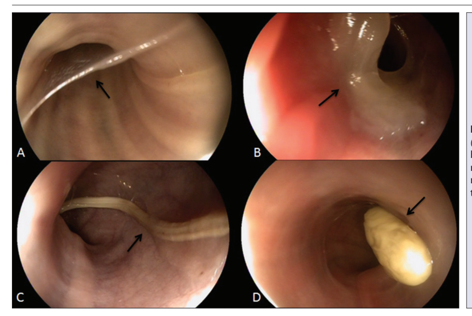
Fig 1. Types of mucus seen in the colon lumen (black arrows): (A) One day old clear and bright mucus (B) More opaque, gelatinous mucus (C) Thick, hardened chord of dried mucus (D) and the "lump" like appearance of the colon content